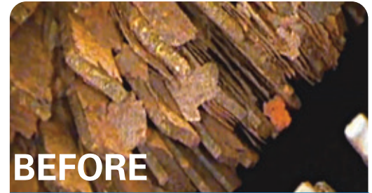
Impacted deposits on finned tubes