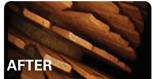
Finned tubes after EPIC cleaning