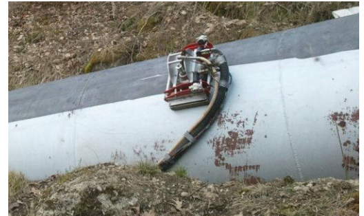
Custom-designed hydrocrawler strips paint off any carbon steel surface. It also vacuums all debris.

CUSTOM Automation Packages. We will customize your challenging project with the safest automated options available and deliver a cost-effective solution unique to your equipment and project needs. Get started with a consultation today – 1-800-849-8040.